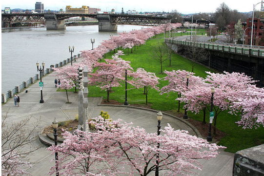
Waterfront Park, Portland, OR

The Trust for Public Land (TPL) recently released its annual ParkScore index, which ranks the park systems of the fifty largest U.S. cities. As with all scorecards, the methodology is imperfect and the metrics are somewhat crude; but seeing how U.S. cities compare across uniform parameters is a good starting point for a larger conversation about what is important to us as a society in urban planning, parks, recreation, and environmental justice.