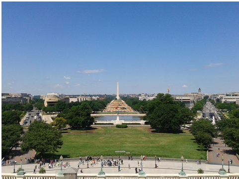
National Mall, Washington, DC

Does it make sense to compare Los Angeles' Topanga State Park —the world's largest urban wildland—to the Jefferson Monument? Does the metric “parks within a 10-minute walk” paint an accurate picture of access and recreational justice, or does it encourage cities to juke stats with tiny, poorly maintained pocket parks that can only service a small number of people at a time? What about the availability of public transportation to parks? Should we give special consideration to certain demographics such as children, the elderly, low-income households, or communities disproportionately burdened with pollution? Are park size, quality, and access of equal importance?