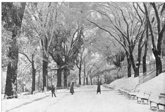
BEACON STREET MALL, BOSTON COMMON, AFTER THE SNOW STORM OF NOV. 6.

Los Angeles receives a middling rank of #34; Chicago is #16; Oakland is #18; and Fresno is dead last. Nationally, TPL found that the median park size is 5.1 acres ; median park acreage is 9.3 percent of total city area; median spending is $76 per resident; and a median of 64 percent of the population lives within a 10-minute walk of a park.