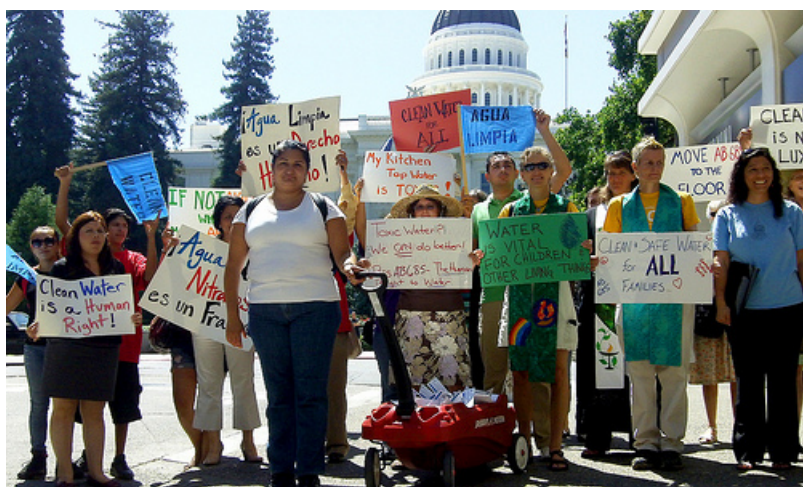
California water activists supporting AB 685 outside the state capitol in December 2011.

Proponents cite a cascade of potential benefits from relocating the program. On a basic level, the reorganization would preserve the DWP's inherent strengths, including its public health expertise and locally distributed staff, as well as the program's "recent positive progress." Aspects of the program stakeholders generally agree work well (e.g., the existing drinking water system permitting process) would continue essentially unchanged. "Additional steps" would streamline the program, improve its overall effectiveness, and enhance access for disadvantaged communities. The State Board's general water quality and financial expertise (including dedicated SRF staff) would lend the program robustness. But the greatest boost in benefits would flow from consolidating state water-quality authority, expertise, and funding under one roof. For example, combined management of the CW and SDW SRFs would "optimize and expedite" funding for multi-benefit water projects, making the Division of Financial Assistance a "one-stop shop for water quality infrastructure financing" for disadvantaged (and other) communities. Introducing a drinking water focus at the State Board would not only enable "maximum program efficiencies." Ideally it would also foster an integrated, synergistic approach to surface-