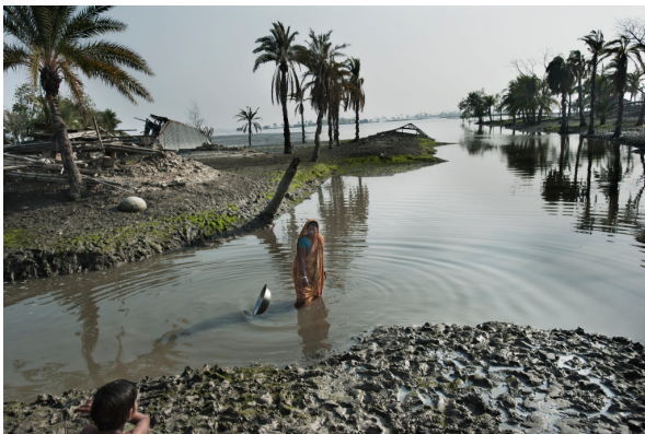
A Women Standing on the Former Site of Her House (NY Times)

Although not mentioned in the article, it's also noteworthy that Epstein is a supporter of the public trust doctrine. His views are more complex than many people (probably including many of his would-be followers) realize.