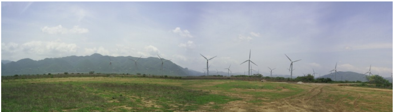
A wind farm in Oaxaca, Mexico.

Governance of the wholesale electricity market and control of the electricity grid will move from CFE to an independent agency. So-called ‘qualified users’ (large electricity purchasers of over 3 megawatts at first, declining to 1 megawatt after three years) must register with the Energy Regulatory Commission (CRE), and if they purchase energy directly from the wholesale market, they must also acquire clean energy certificates.