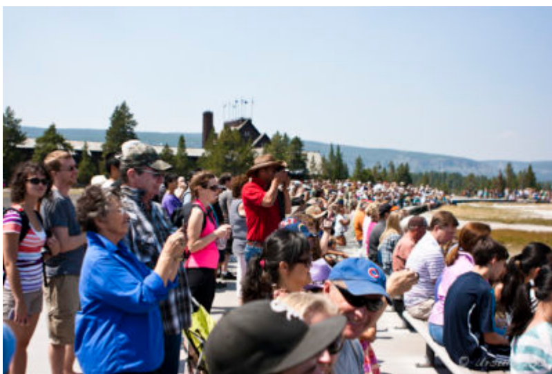
Crowds gather in Yellowstone National Park to watch the geyser Old Faithful erupt.

Kipling's displeasure is partially explained by the fact that, like the other 19th century park visitors who offended him, Kipling rarely ventured from the main roads and heavily-publicized attractions such as Old Faithful. Had he explored Yellowstone's backcountry, Kipling might have formed a decidedly different opinion of the park.