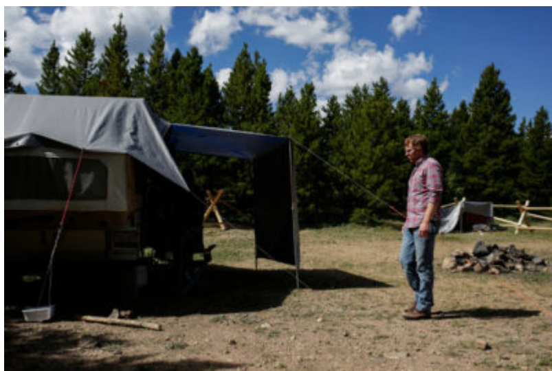
A man approaches a homeless camp at a park in Colorado.

Earlier this week, the New York Times ran an article entitled, "Tensions Soar as Drifters Call National Parks Home." That piece chronicles the growing trend of homeless people to take up unauthorized residence in the national parks. Many of these unfortunate folks suffer drug and alcohol addiction and mental health problems. Their homeless encampments often generate sanitation and sewage problems, disrupt park vegetation and animal populations, and can be the source of potentially-disastrous wildfires sparked by unattended campfires. National park officials also report an increased number of confrontations between homeless squatters and more conventional (and legal) park users. The risk of such confrontations places still greater pressure on park rangers to keep the peace and defuse those confrontations. How the Park Service resolves the homelessness problem, which often seems intractable even in urban settings, will be a daunting challenge for the NPS.