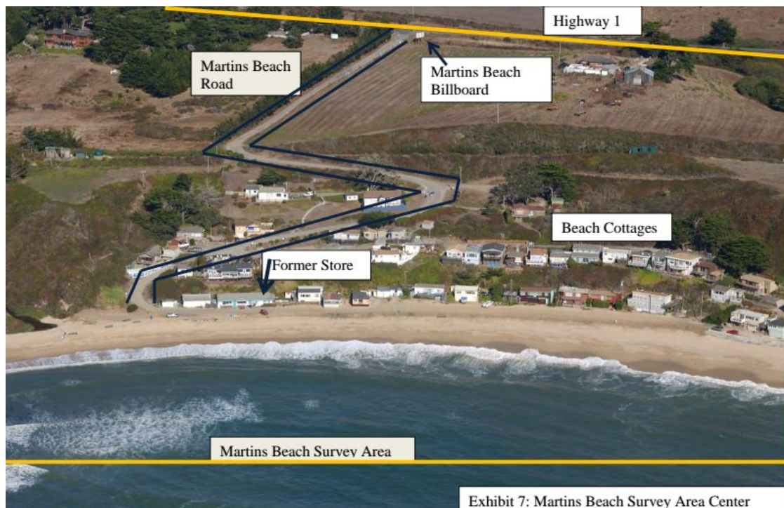
Diagram compliments of the California Coastal Commission survey exhibit

(Surfrider's lawsuit is only of several legal initiatives commenced to keep the Martin's Beach accessway open. Another NGO, Friends of Martin's Beach, filed suit against Khosla, arguing that the public has a state constitutional right of access to Martins Beach or, alternatively, that Khosla's predecessor had permanently dedicated a right of access to the public that Khosla could not revoke. [That case remains pending in the trial court.] Meanwhile, Khosla filed his own preemptive lawsuit against the Coastal Commission and San Mateo County, seeking a court ruling that he was not legally required to maintain public access to Martins Beach. [Khosla's lawsuit was dismissed by the trial court on procedural grounds.] Both the Coastal Commission and the county have sent Khosla formal letters advising him of the government regulators' position that the landowner's unilateral termination of public access to Martins Beach indeed constitutes "development" requiring a coastal development permit under the Coastal Act before public access can be eliminated. And, finally, the California Legislature enacted legislation in 2014 authorizing the California State Lands Commission to acquire a right-of-way or easement across Khosla's property to Martins Beach, by eminent domain if necessary. [So far, the Lands Commission has not initiated legal action to secure that accessway.]