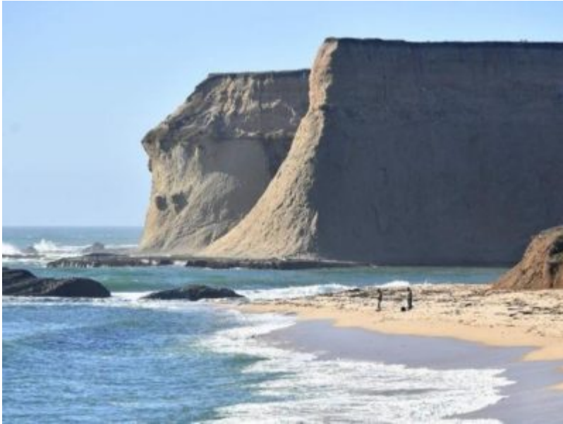
Martins Beach: It Will Be Back

High-fives, or at least, sighs of relief, from environmentalists this week, as the Supremes denied cert in Surfrider Foundation v. Martin's Beach , a case where Sun Microsystems founder and multibillionaire Vinod Khosla challenged aspects of California's Coastal Act. Article after article after editorial is celebrating this as a great victory for the environment and the California coast. But even scratching the surface of this case shows 1) that it will be back; and 2) billionaires have a way of getting favorable and massive press coverage.