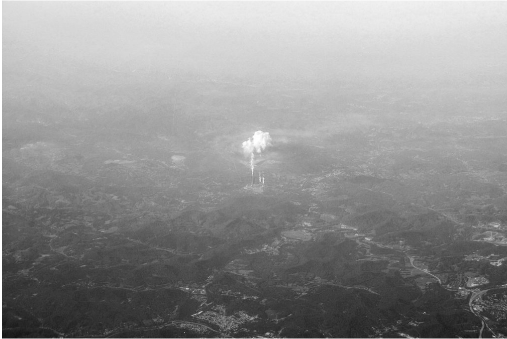
John E. Amos coal-fired power plant in West Virginia, visible from a passing airplane.

As I explained back in August, the Trump Administration's proposed Clean Power Plan replacement (the "Affordable Clean Energy" or ACE rule) came with a significant change to how the EPA has traditionally interpreted the Clean Air Act's New Source Review (NSR) provisions mandating pre-construction environmental review and the installation of air pollution controls to offset emission increases. In my previous post , I outlined the practical dangers of the proposed change: effectively, the Trump EPA is proposing to exempt polluting equipment at coal-fired power plants from undergoing legally required environmental review before upgrading to comply with the ACE rule's energy efficiency standards. Since coal-fired plants are filled with aging equipment that pre-dates the 1977 Clean Air Act amendments, EPA's own data shows 35% of coal-fired plants have no control equipment at all for NOx emissions, 22% lack control for SOx emissions, and more than 80% of coal-fired plants have emission rates exceeding those typically required under NSR. In the normal course of things, this grandfathered equipment would either be retired and replaced with new equipment subject to NSR, or be upgraded through a modification triggering NSR. Instead, the Trump EPA is seeking to give these aging plants a golden ticket: upgrade your equipment without undergoing environmental review, and extend the expected lifetime of these pollution-spewing equipment for decades.