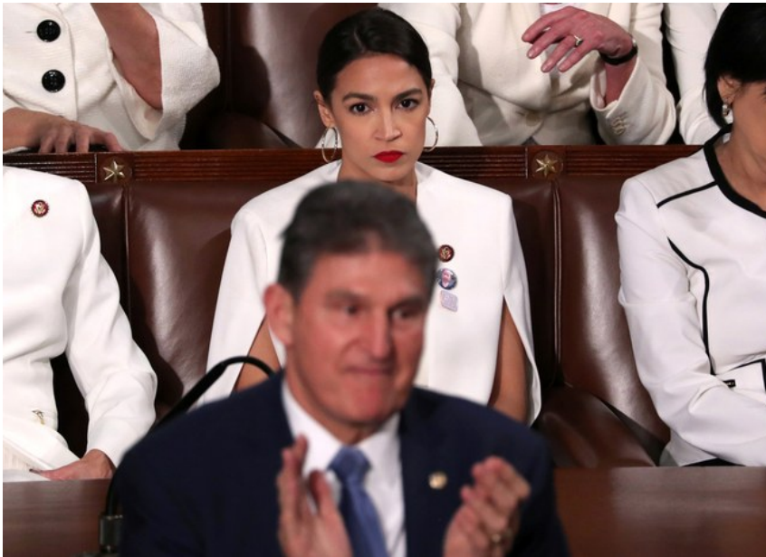
AOC during the Feb. 5th State of the Union address

(For the straight white male Boomers reading this post, I'd like you to sit with that for a moment. Imagine a world in which your voice, your perspective, has never been represented by the people writing our laws. Now imagine someone telling you to smile more .)