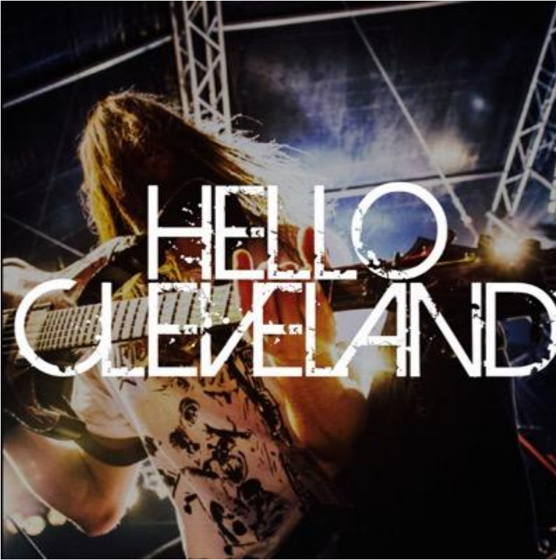
Proposed New Slogan