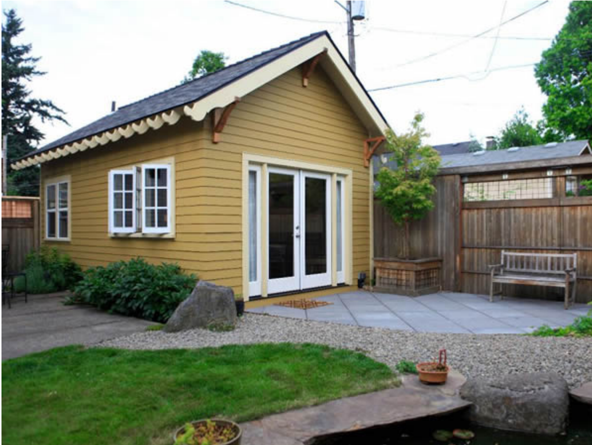
Granny Flat: Supposedly Destroying Single-Family Neighborhoods

It's not often that you get some good planning news from Los Angeles, but at least if you believe the City's numbers, there are some.