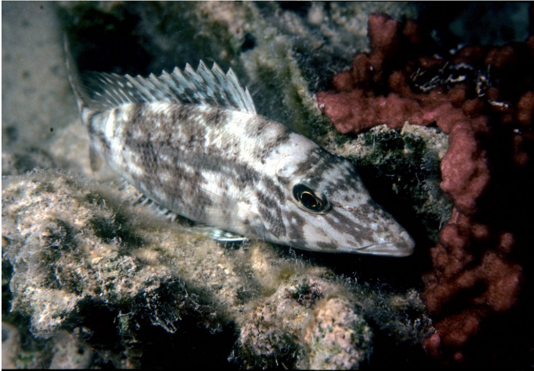
The smalltooth emperor, a resident of One Tree Reef, part of the Southern Great Barrier Reef

The carbonate cycle helps make the oceans one of the largest carbon sinks on the planet. As the oceans' surface waters mingle with the open air, they absorb enormous amounts of carbon dioxide (CO 2 ), storing it in the water as carbonic acid and carbonates and as limestone on the seafloor. The carbonate cycle is a natural process that far predates humans and industrialization, but as humans have added more CO 2 to the atmosphere, the oceans have absorbed more CO 2 —more than a third of anthropogenic CO 2 emissions released over the past 200 years. Though this absorption has spared us worse climate impacts, it has made the oceans 30% more acidic , on average. Ocean acidification is extremely harmful to marine life, threatening entire ecosystems and the human activities that rely on them.