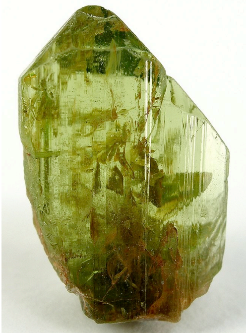
An unusually glamorous example of olivine, a common mineral found in the Earth’s crust.

AOA would take advantage of the carbonate cycle’s workings to spur increased CO 2