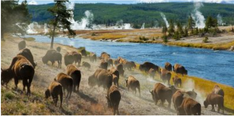
Yellowstone National Park

American author, historian and conservationist Wallace Stegner once observed: