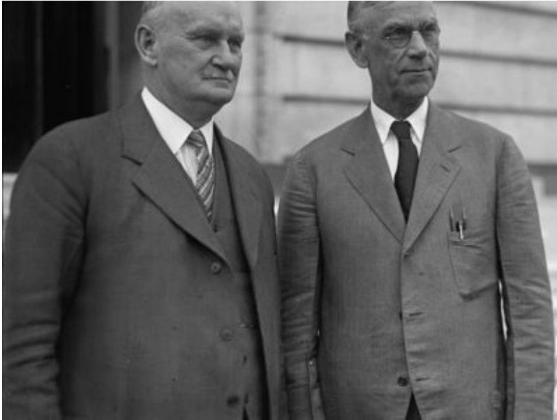
Willis C. Hawley (left) and Reed Smoot: Climate Warriors?

So Donald Trump has imposed massive tariffs on Canada and Mexico, and then paused them, and then imposed them again, and then paused them — as always, he is the master of political coitus interruptus. But Canada has not backed off and is maintaining its current retaliatory tariffs: Trump has already promised more and is still moving ahead with steel and aluminum tariffs. Already the markets are beginning to panic,