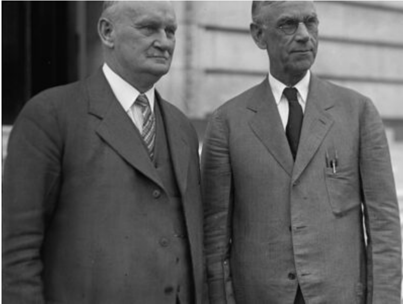
Willis C. Hawley (left) and Reed Smoot: Climate Warriors?

So Donald Trump has imposed massive tariffs on Canada and Mexico, and then paused them, and then imposed them again, and then paused them — as always, he is the master of political coitus interruptus. But Canada has not backed off and is maintaining its current retaliatory tariffs: Trump has already promised more and is still moving ahead with steel and aluminum tariffs. Already the markets are beginning to panic,