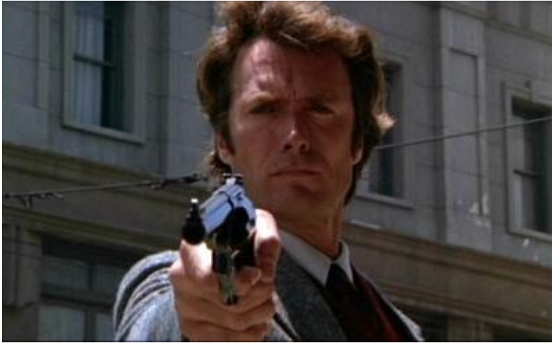
Not Your Typical Climate Scientist