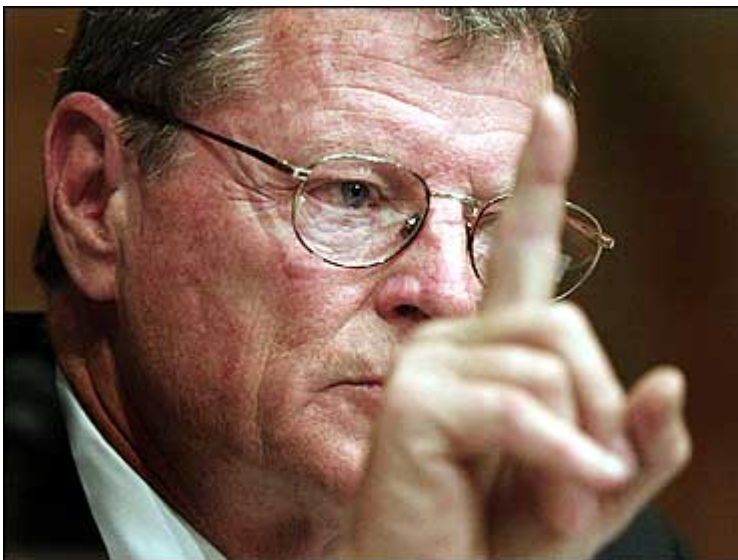
Sen. James Inhofe (R - Olduvai Gorge)

There is a simple answer to his question: they aren't actually climate skeptics . The rabid conservative opposition to climate regulation does not come from “skeptics,” who might doubt the science. It comes from those who aren't “skeptical” at all: they are, instead, absolutely sure that climate change is a fraud. It is a conspiracy to scare the public into expanding the state.