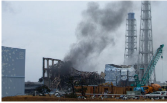
Fukushima Nuclear Accident

As Fukushima revealed, the Japanese nuclear industry had a very cozy relationship with regulators. That kind of coziness is not unheard of in the U.S. context, either. After the Three Mile Island accident, Congress divided the responsibilities of the Atomic Energy Commission, giving its mandate to promote nuclear power to DOE and its regulatory authority to the Nuclear Regulatory Commission (NRC). But in terms of creating an impartial regulatory body, this move was at best a partial success.