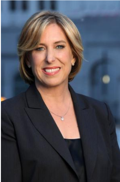
Wendy Greuel: Nice

Tomorrow, Los Angeles voters go to the polls to elect a new Mayor. (At least a few of them, anyway: current estimates predict only 25% turnout, about which more later). In September, New Yorkers will do the same. And depending upon the way things turn out, political and cultural reporters could have a field day.