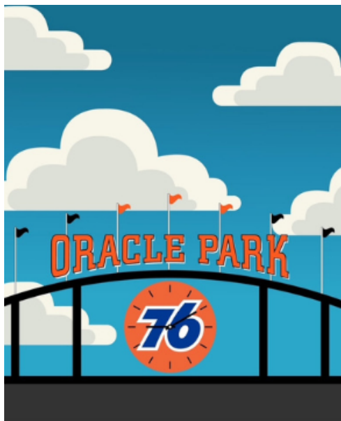
76 It's time! 76® is officially a sponsor of the BIG team from San Francisco. — if you catch our drift 🤔👉