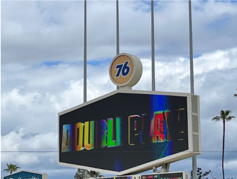
One of the 76 gas signs at Dodger Stadium.

The Los Angeles Dodgers have all but ignored the growing calls from fans, activists, columnists, researchers, and a state lawmaker asking the team to cut ties with Big Oil and remove the two huge, orange 76 gas ads that dominate the club's picturesque scoreboards. But the team's streak may be coming to an end: They can't ignore the International Olympic Committee.